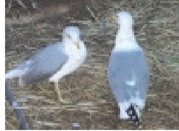
CHASTON & MARK